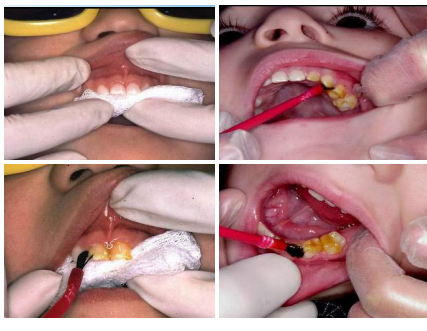
Figure 3. Applying fluoride varnish.

The varnish is colorless or caramel-colored. It forms a sticky layer on the tooth that hardens on contact with saliva and penetrates the tooth enamel. Allow varnish to remain on the teeth overnight.