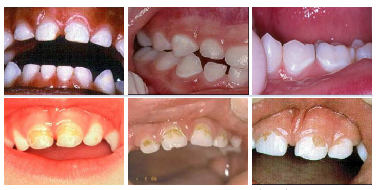
Figure 2. Signs of childhood caries: (top) early decay: white spots; (bottom) later decay: brown spots. Used with permission of the AAP.