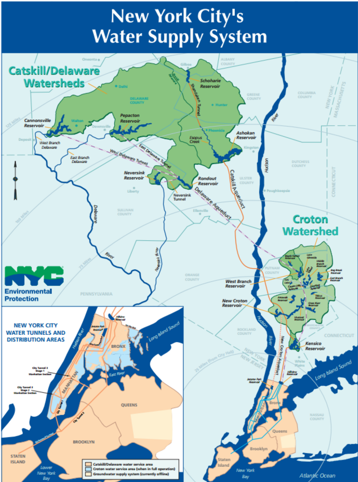
Source: NYC DEP Drinking Water Supply and Quality Report, 2014