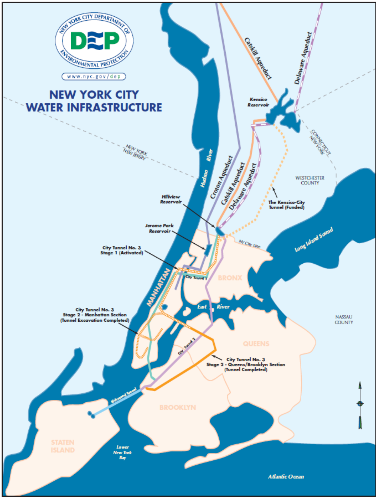
Figure 2: NYC Aqueducts and Water Tunnels