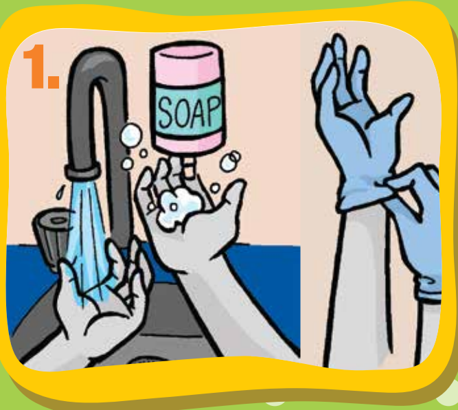
1. Wash hands and wear gloves. Have all your supplies organized and within reach.