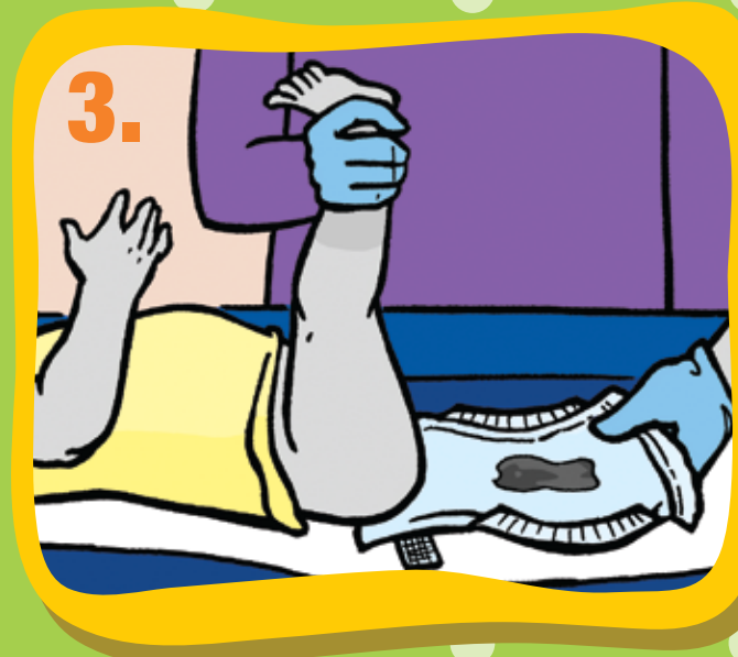
3. Remove the soiled diaper.