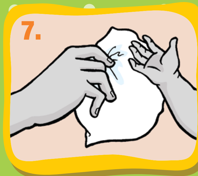
7. Clean the child's hands. Soap and water is best.