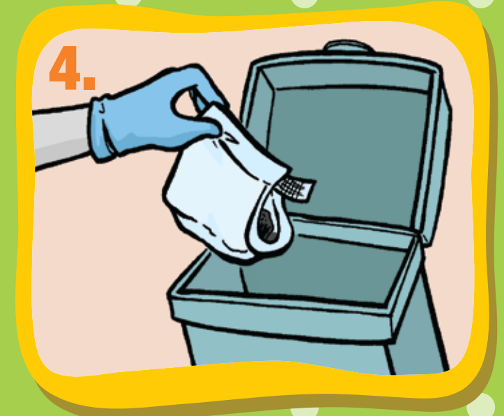
4. Throw the soiled diaper into a pail with a lid.