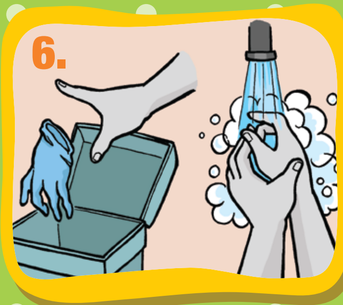
6. Dispose of gloves and wash your hands thoroughly.