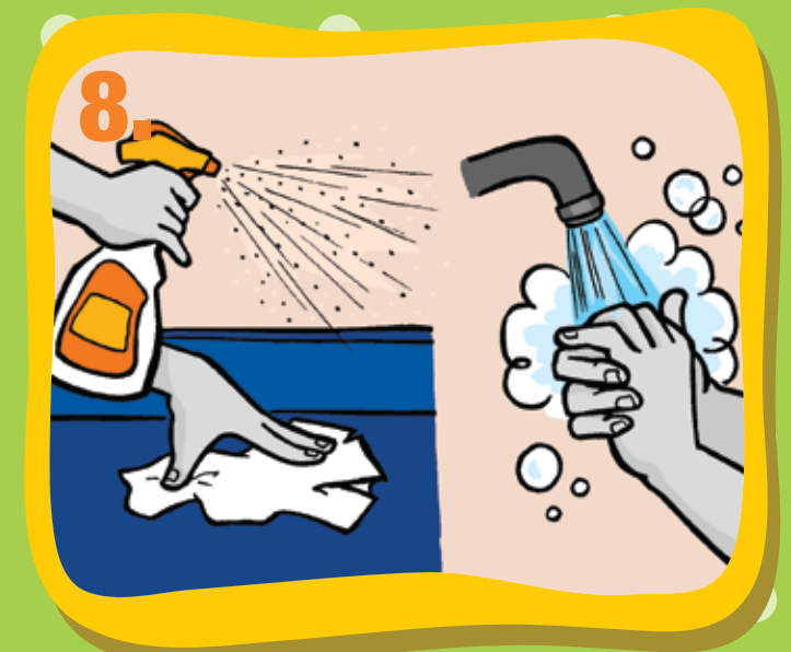
8. Clean and sanitize the changing station. Wash hands again when finished.

KEEP CHILDREN SAFE AND HEALTHY. NEVER LEAVE CHILDREN UNATTENDED.