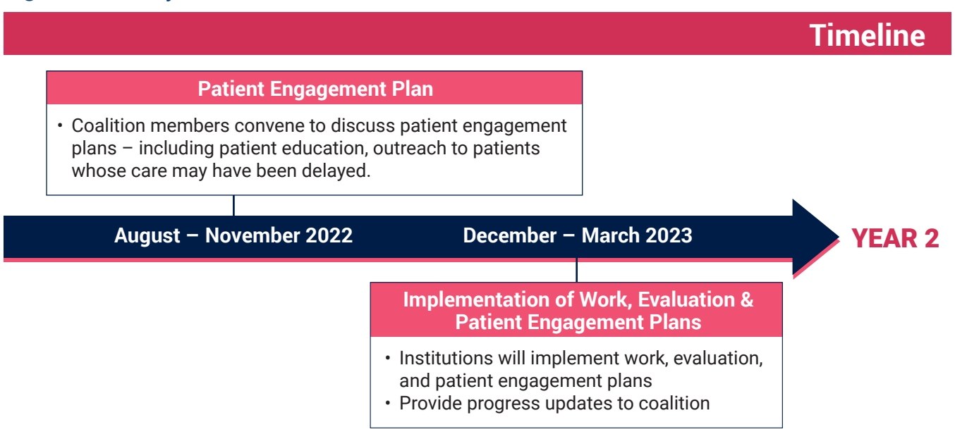
Figure 4. Activity Timeline for Year 2 of CERCA

CERCA's second year report will include more robust information on early outcomes and lessons learned. This will ideally include summaries of final work, evaluation, and patient engagement plans; clinician and patient education materials; initial reporting of process measures and institutional outcomes; and measurement of citywide population health outcomes.