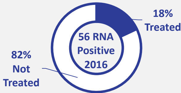
Treated by end of 2017

Number of people who tested hepatitis C RNA positive at Flushing Hospital Medical Center in 2016 and 2017, and percentage who initiated treatment by the end of 2017 and 2018.