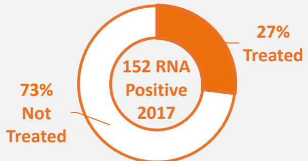
Treated by end of 2018

Data source: New York City Health Department Surveillance.