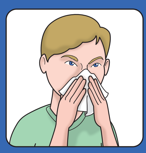
Cover your mouth and nose with a tissue when you cough or sneeze.