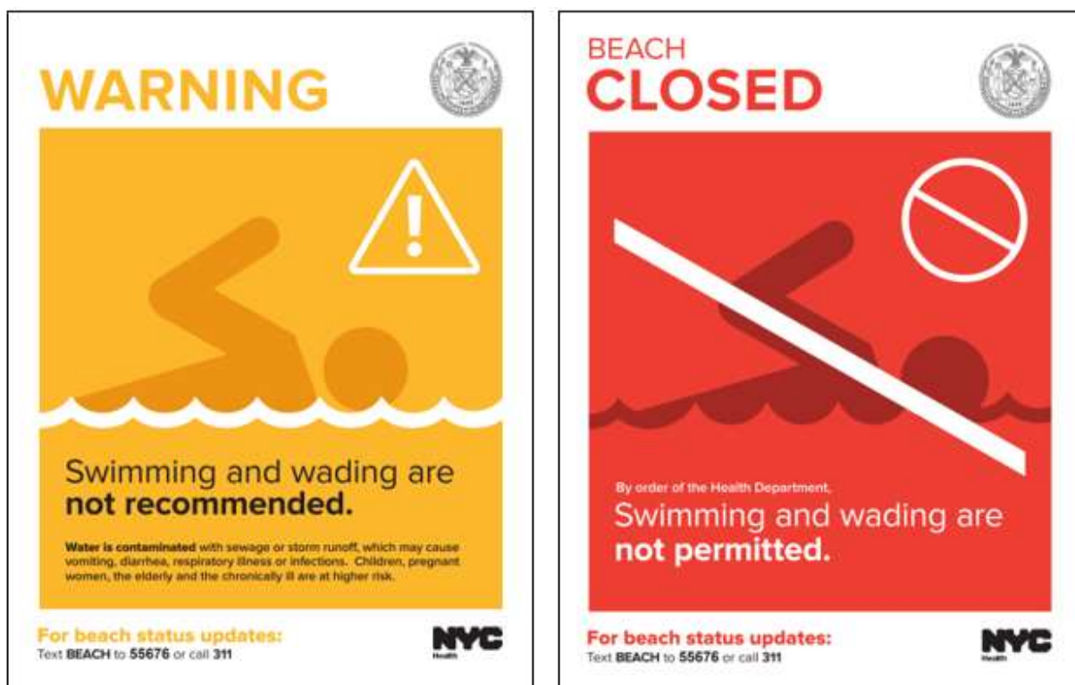
FIGURE 2: BEACH ADVISORY AND CLOSURE SIGNS

“Know Before You Go” Texting Service: The “Know Before You Go” texting service, introduced in 2014, was continued for the 2024 beach season. The free service enables subscribers to make informed decisions before they go to a public beach. Through this service, users can check whether the beach is open or closed or if there are any advisories due to wet weather conditions or water quality concerns. Subscribers simply text “BEACH” to 55676 to learn the status of any of the eight public beaches in NYC. The service can also provide safety-related messages, such as warnings for high rip currents and closures for extreme weather.