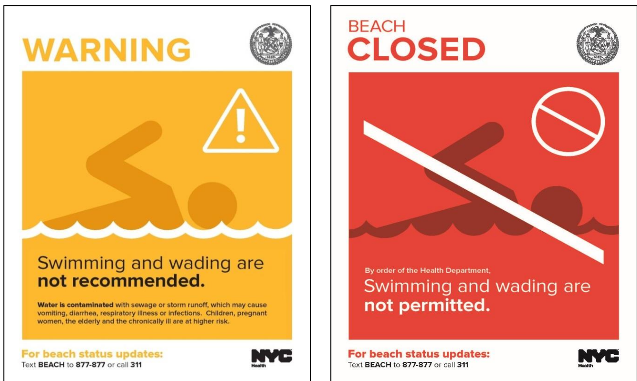
FIGURE 2: BEACH WARNING AND CLOSED SIGNS

“Know Before You Go”, a free texting service introduced in 2014, was continued for the 2022 beach season. The service enables subscribers to make informed decisions before they go to a public beach. Through this service, users can check whether the beach is open or closed or if there are any warnings due to wet weather conditions or water quality concerns. Subscribers