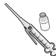
Multi-step Intramuscular Injection

*The Evzio auto-injector is available without a prescription at CVS, Duane Reade and Walgreens. Evzio is available at additional pharmacies with a patient-specific prescription.