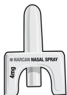
Single-step Nasal Spray