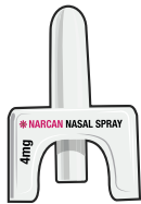
Single-step Nasal Spray