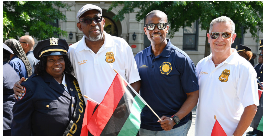
On Sept. 15, our members also visited Adam Clayton Powell Jr. Boulevard in Harlem to march with New Yorkers in the 55th Annual African American Day Parade.

Follow Us: JoinTheBoldest JoinTheBoldest CorrectionNYC NYC Department of Correction JoinTheBoldest