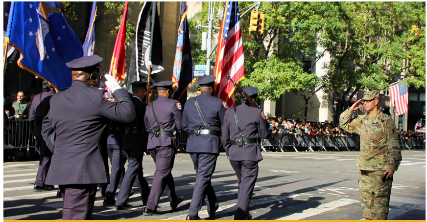
A heartfelt salute to all veterans. May we always remember and honor their service with the respect and appreciation they truly deserve.

Follow Us: JoinTheBoldest JoinTheBoldest CorrectionNYC NYC Department of Correction JoinTheBoldest