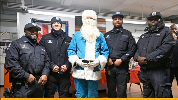
Heroes in our K-9 Unit joined Officer Santa Claus and his merry helpers from the First Responders Lions Club on Dec 13 to distribute toys to kids at the NYPD 63rd Precinct in Brooklyn.