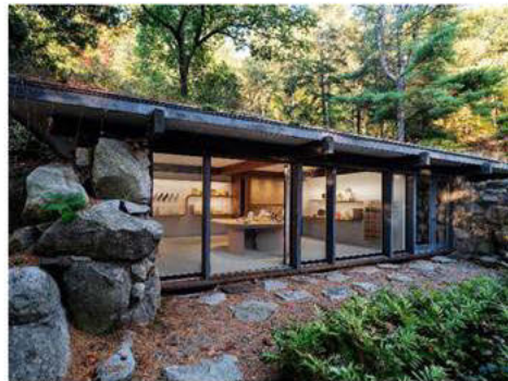
Manitoga / The Russel Wright Design Center's new Design Gallery Exterior

ANITA JORGENSEN LIGHTING DESIGN • [REDACTED] Lafayette Street, Suite 604 • New York, NY 10013 • T [REDACTED]