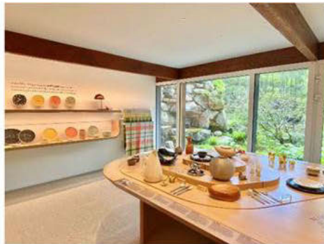
Manitoga / The Russel Wright Design Center's new Design Gallery Interior