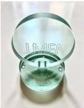
Winner: Illuminating Engineering Society NYC Lumen Award 2022