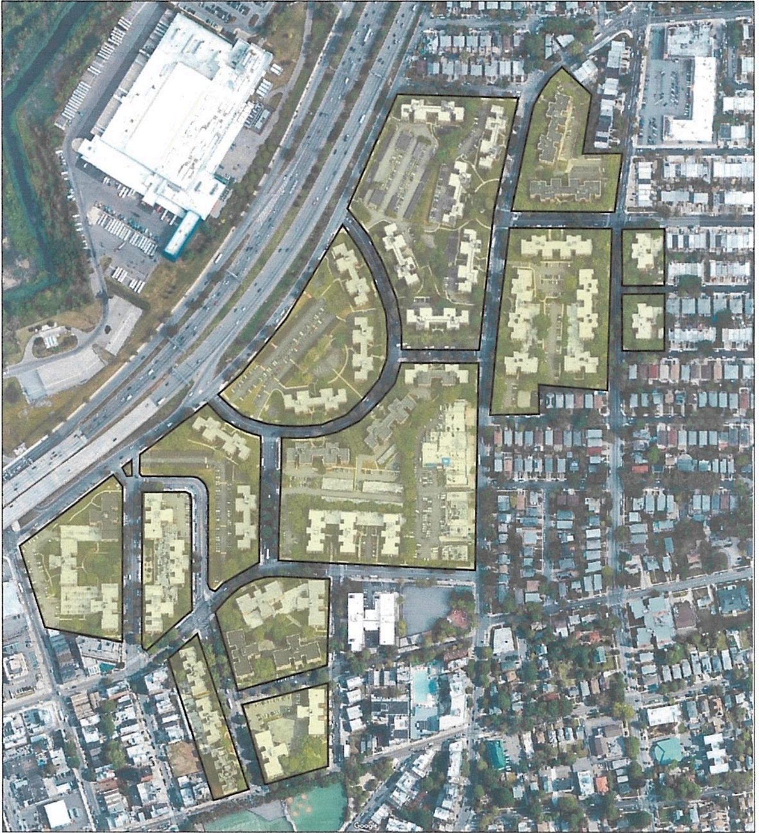
Mitchell-Linden – Aerial View