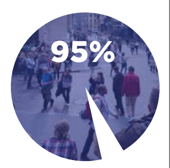
In 2018, nearly all people experiencing homelessness in New York City were sheltered (95%).

Every engagement represents progress in the right direction, and the more opportunities we have for engaging New Yorkers in need, the better. We remain focused on increasing pathways off the street for these New Yorkers, and we are undeterred in our efforts to offer a helping hand.