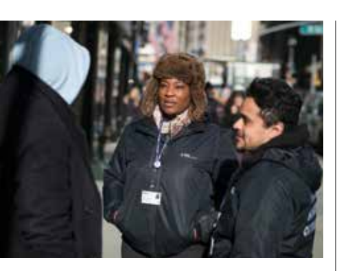
HOME-STAT is the largest dedicated outreach team in the nation engaging those experiencing street homelessness 24/7/365, no matter what the weather.

In their ongoing efforts to offer services, supports, and a helping hand, HOME-STAT outreach teams have access to: