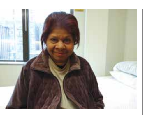
The Kelly, a Safe Haven in Harlem, offers 60 beds and comprehensive, on-site case management, psychiatric care, and housing placement for men and women with mental health illnesses.