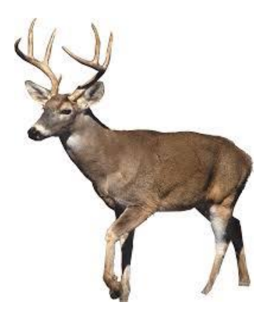
White Tailed Deer