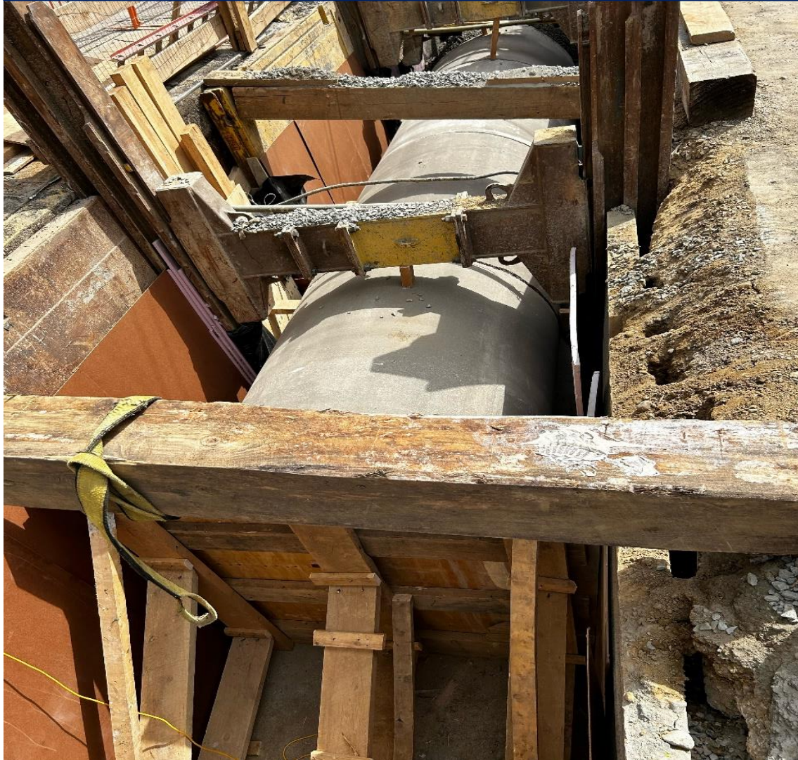
Storm Sewer 120 Street btw 20 Avenue – 18 Avenue