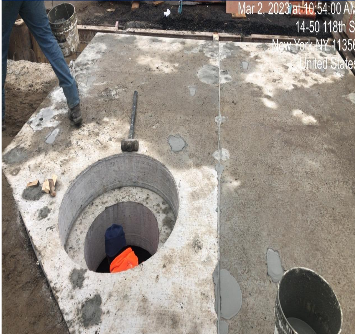
Chamber No. 4 (Work in progress) Intersection of 120 th Street and 18 th Avenue

Mar 2, 2023 at 10:54:00 AM 14-50 118th St New York NY 11356 United States