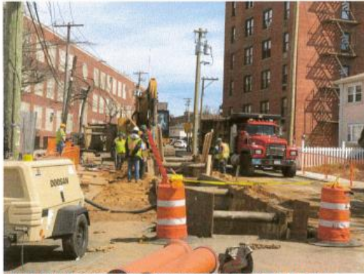
SANITARY SEWER PLACEMENT LOCATED AT BRIAR PLACE ALONG BROOKHAVEN AVENUE & COLLIER AVENUE