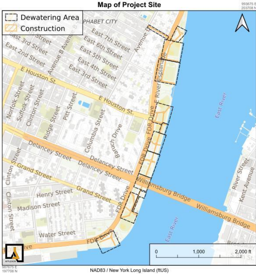
Figure 1. East Side Coastal Resiliency Project Location Map