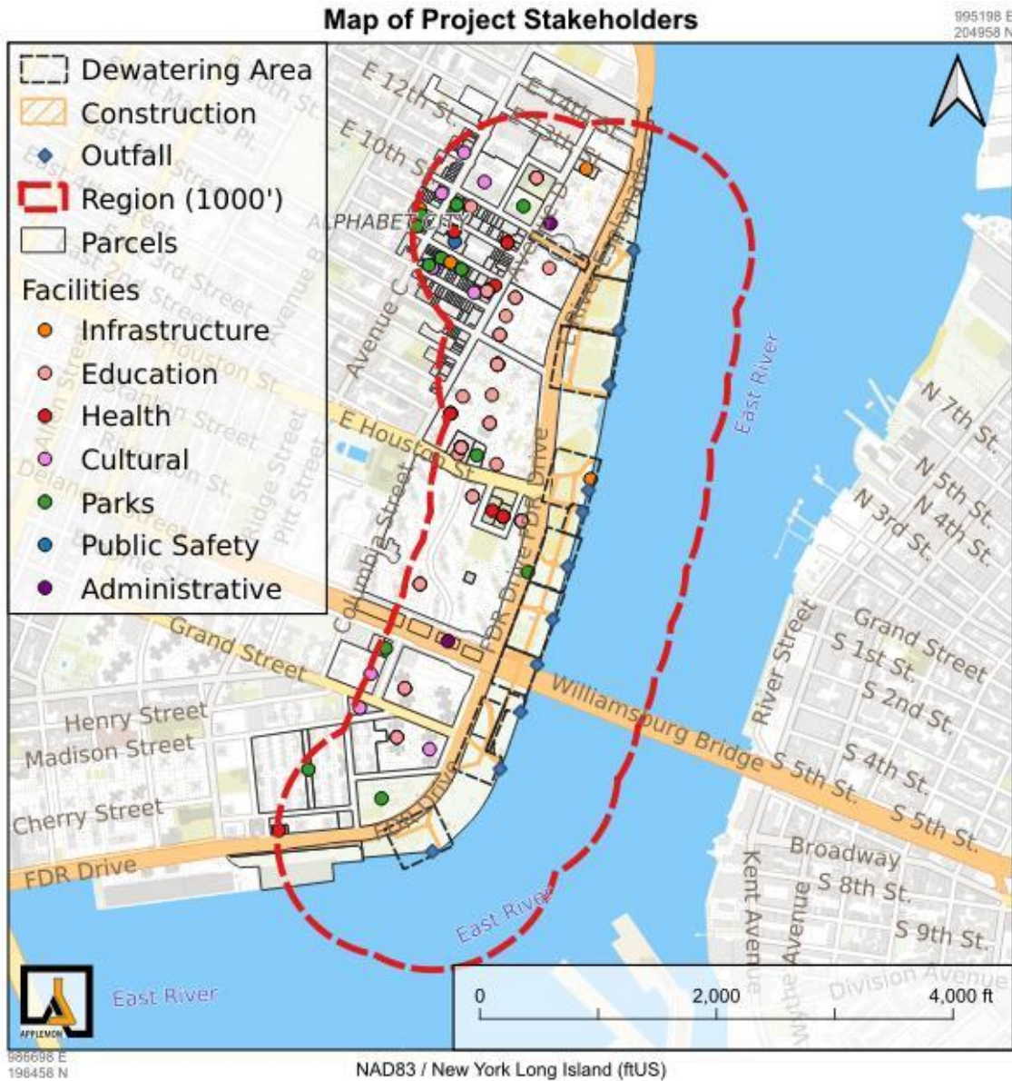
Figure 4. Project Stakeholders Map