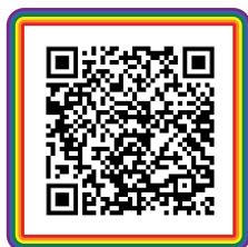
Public Health Adviser II

The City of New York is an inclusive, equal opportunity employer. Any questions? Contact us today at recruit@health.nyc.gov .