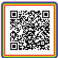
Public Health Adviser I