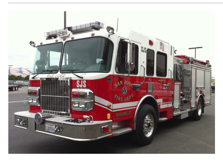
Biodiesel fire engine in San José, California.

Biodiesel is a readily-accessible alternative fuel that is an asset to communities during emergencies, particularly when there is an increased need for heavy-duty, diesel-fueled equipment. Biodiesel can be used in existing diesel engines, and fleets that have transitioned to biodiesel have used the vehicles to perform critical services during gasoline and diesel shortages. Moreover, fleets that have installed biodiesel storage tanks and generators have used their on-site refueling capability to ensure continuous operation during disasters, and provide needed fuel to other emergency fleets. Fleets that transition to biodiesel have also experienced lower fuel costs and have lessened their environmental impact.