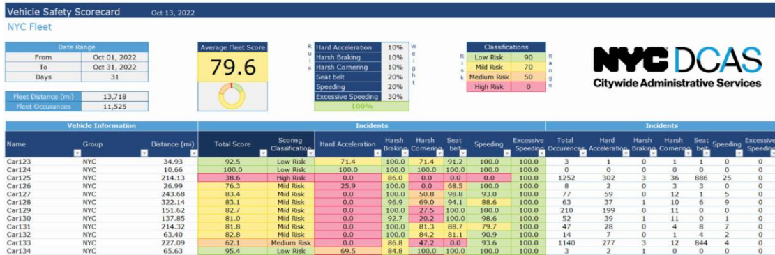
An agency Vehicle Safety Scorecard report from the DCAS Fleet Office of Real Time Tracking (FORT)

DCAS can also prepare a risk assessment for each vehicle based on its driving behaviors. Some driving behaviors are issues of law like speeding and seatbelt use; others are indicators of unsafe driving habits including flooring the accelerator called hard acceleration, slamming the brakes called hard braking, and taking fast turns called hard cornering.