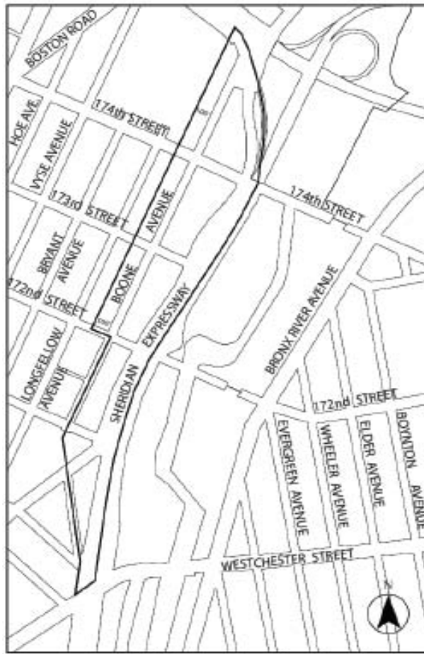
Portion of Community District 3, The Bronx

The Bronx Community District 6 In the R7A, R7X, and R8A and R8X Districts within the areas shown on the following Maps 1, 2, 3, and 4 and 5: