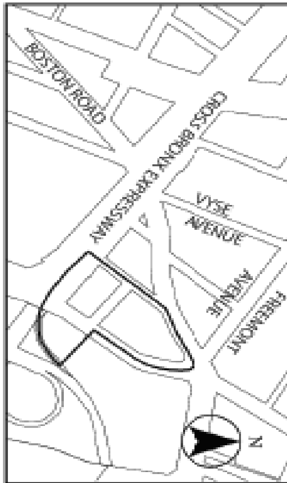
Portion of Community District 6, The Bronx