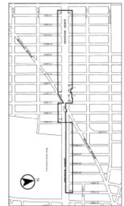
Portion of Community District 2, Queens * * *