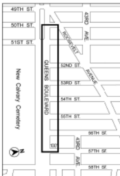
Map 1 - (NEW Map 1, Showing the Extension of the Existing Inclusionary Housing District)