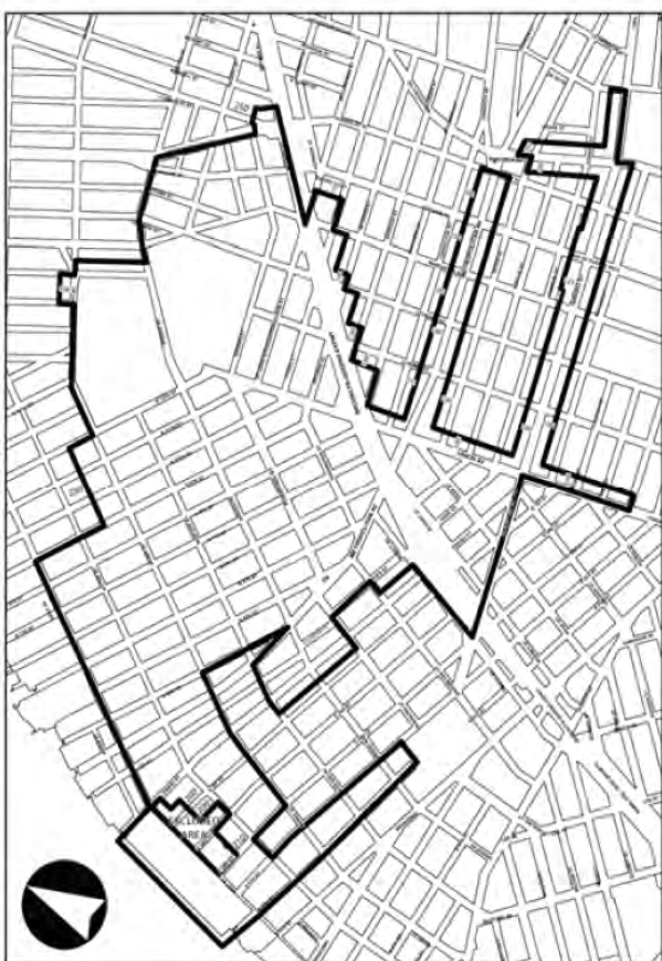
Portion of Community District 1, Brooklyn