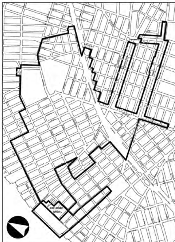
Portion of Community District 1, Brooklyn