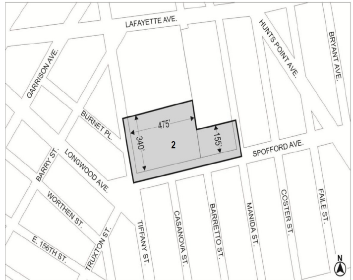
Map 2 - [date of adoption]

Mandatory Inclusionary Housing Program Area see Section 23-154(d)(3)