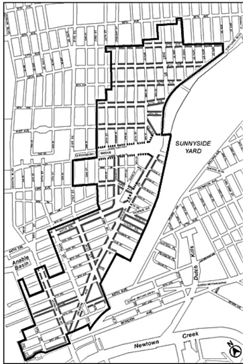
— Unenclosed Sidewalk Cafes ..... Small Sidewalk Cafes Only