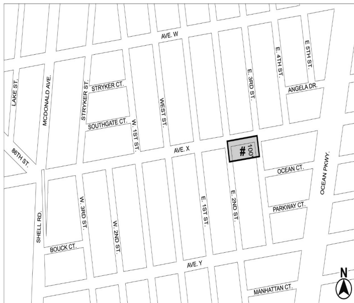
█ Mandatory Inclusionary Housing Program Area see Section 23-154(d)(3) Area # [date of adoption] MIH Program Option 1 and Option 2

Portion of Community District 15, Brooklyn