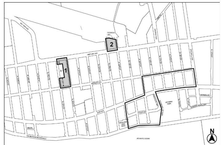
Former Inclusionary Housing designated area Mandatory Inclusionary Housing area Area 1 - 3/22/18 MIH Option 1 Area 2 - 5/28/25 MIH Option 1 and Option 2