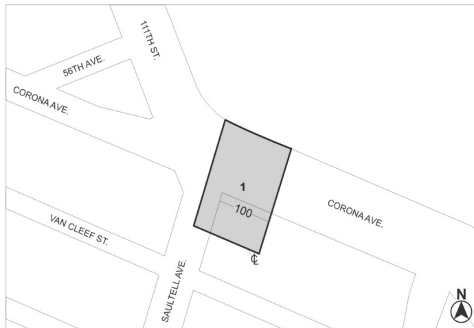
Mandatory Inclusionary Housing Area see Section 23-154(d)(3)