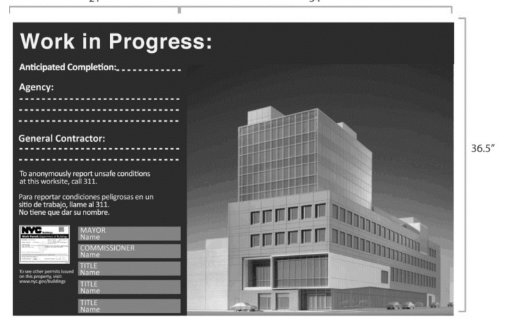
Figure Fence Project Information Panel Layout for Small Lots