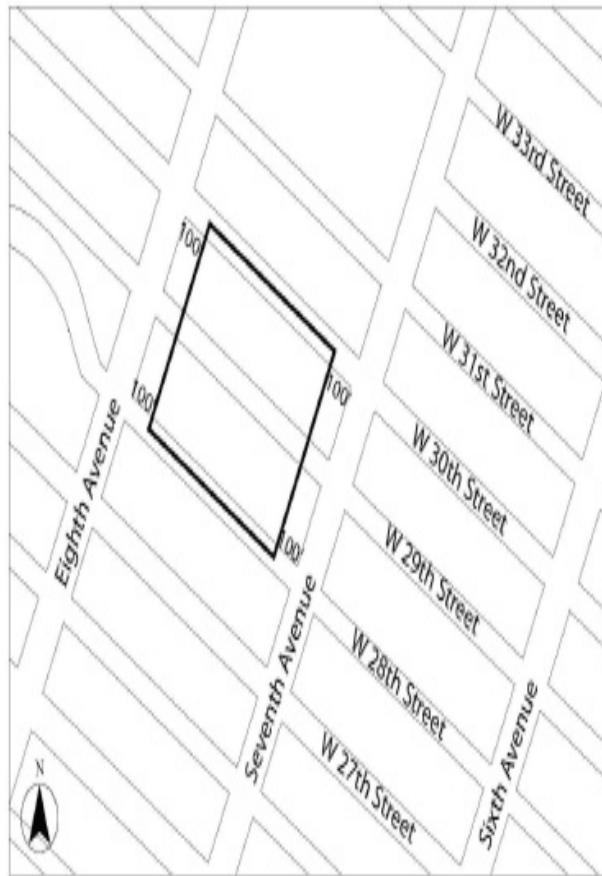
Map ____ . Portion of Community District 5, Manhattan