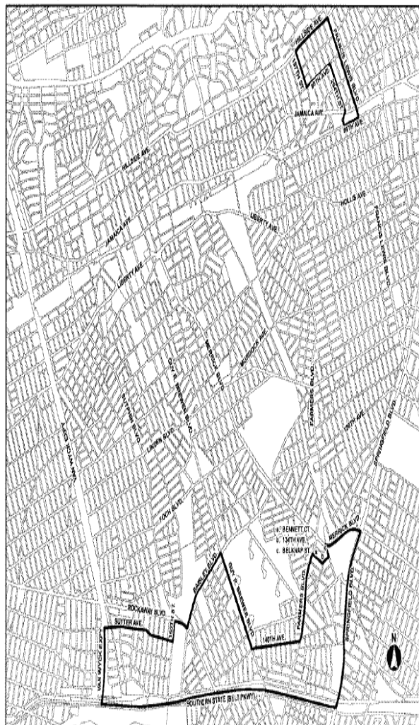
Map 5. Excluded portions of Community District 12, Queens

Appendix A FRESH Food Store Designated Areas; Excluded Portions