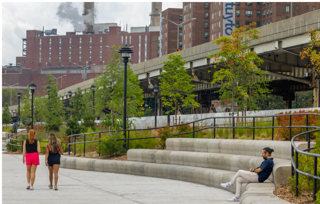
Stuyvesant Cove Park