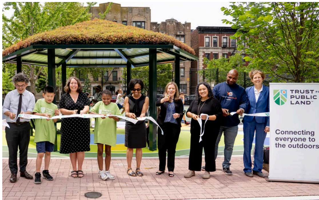
Opening of green schoolyard at PS38K in Brooklyn