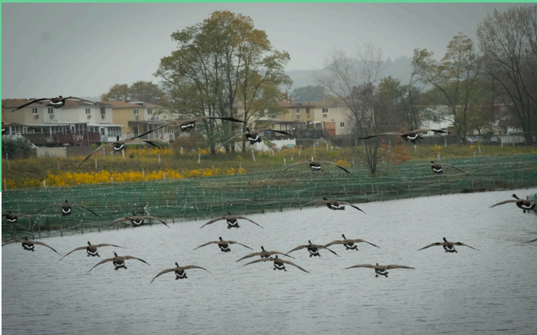
$48 million upgrade for the Staten Island Bluebelt expansion