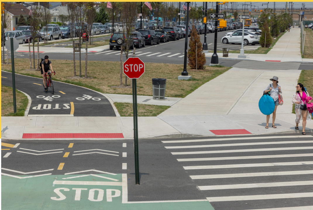
New Beach 108 Street bike path in the Rockaways