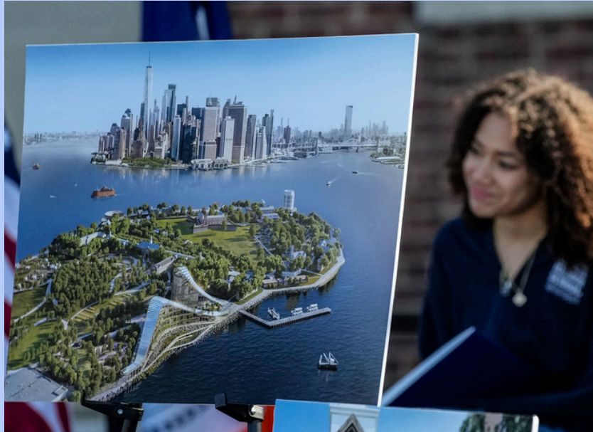
Launch of the Center for Climate Solutions initiative on Governors Island