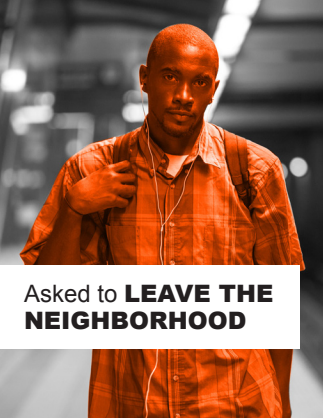
Asked to LEAVE THE NEIGHBORHOOD