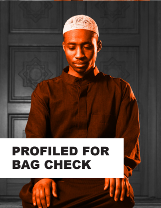
PROFILED FOR BAG CHECK