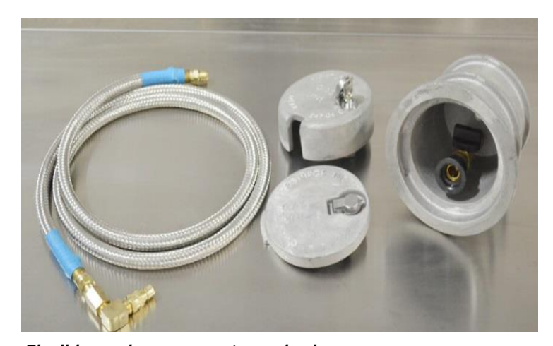
Flexible gas hose connector and valve