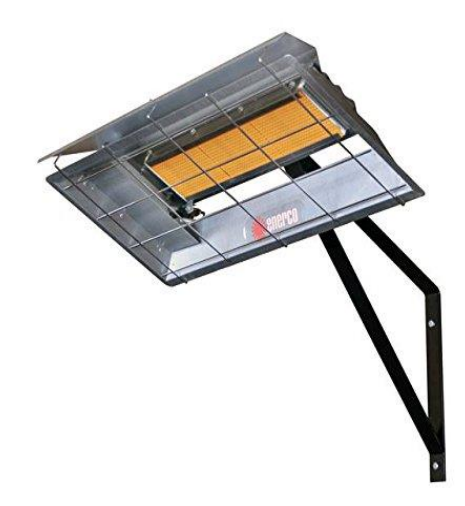
Wall-mounted Natural Gas Heater