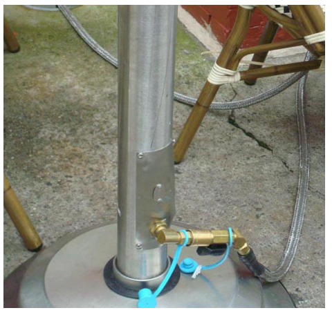
Flexible gas hose connector at portable gas heater (seen without protective cover)