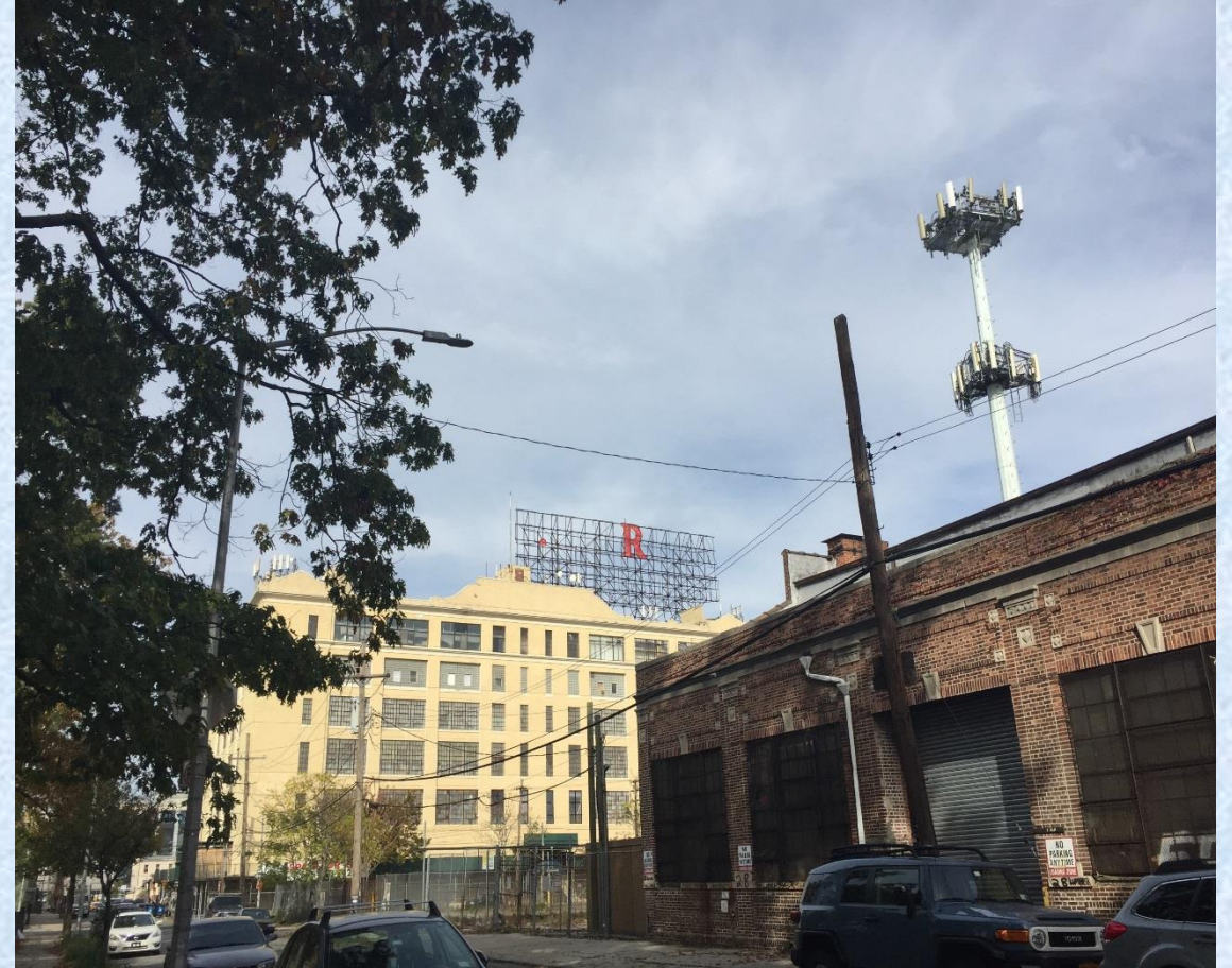
From Verona Street Lot and warehouse