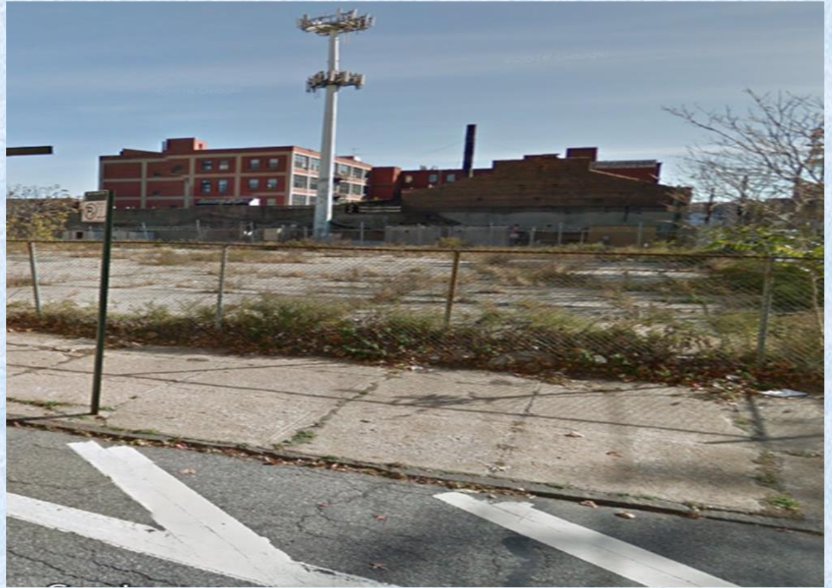
From Richards Street