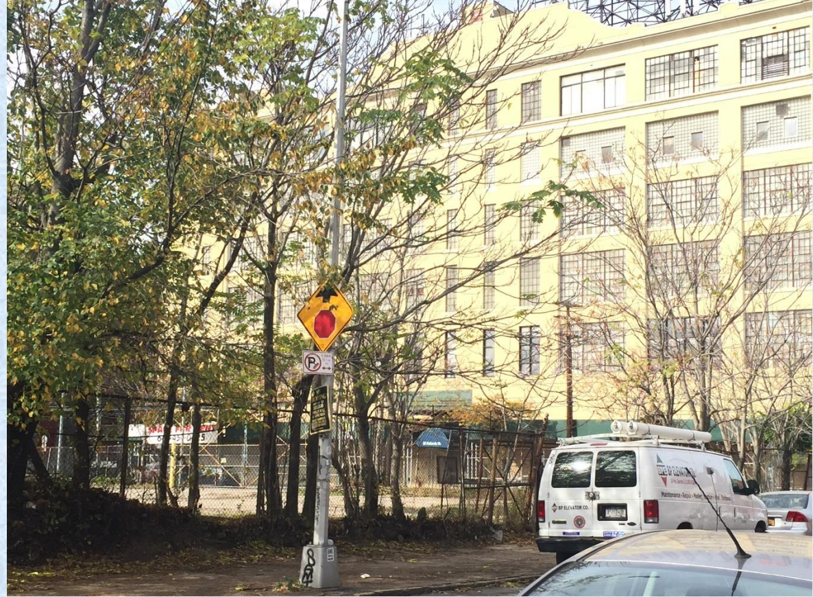
Delavan Street view Warehouse and lot