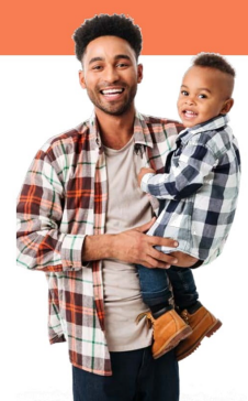
Las fotografías son únicamente para fines ilustrativos. Las personas que aparecen en ellas son modelos.