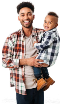
Photo for illustration purposes only. The people shown are models.