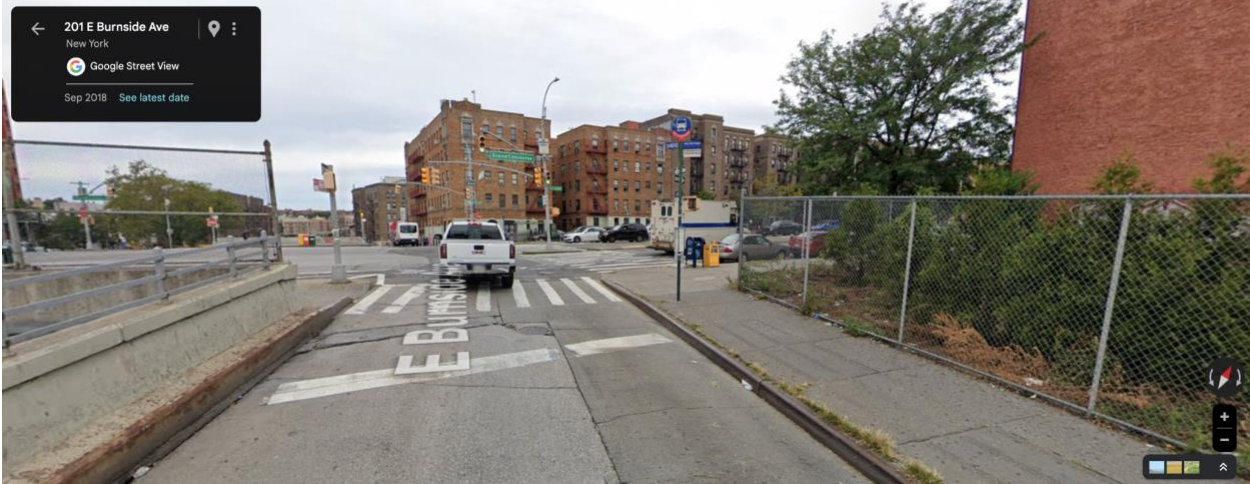
September 2018 shows a westbound Bx40/42 bus stop on the NE corner of Burnside Avenue and the Grand Concourse. The adjacent lot (2050 Grand Concourse) was unused at this point.