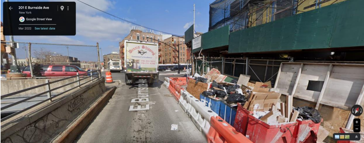
March 2022, the most recent data available from Google Maps, shows that the westbound Bx40/42 bus stop on the NE corner of Burnside Avenue and the Grand Concourse is no longer present. Construction on 2050 Grand Concourse resulted in this bus stop being removed from service, and it continues to be missing at the writing of this resolution.

BCC Campus * Gould Hall, Room 200 * 2155 University Avenue * Bronx, New York 10453 Telephone (718) 364-2030 * Facsimile (718) 220-8426 * bx05@cb.nyc.gov