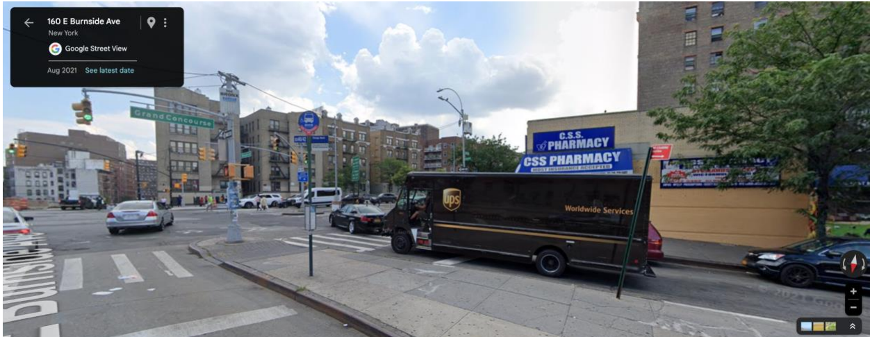
August 2021 shows an eastbound Bx40/42 bus stop on the SW corner of Burnside Avenue and the Grand Concourse.