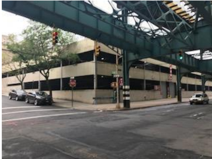
Parking Garage on 164 and River Avenue