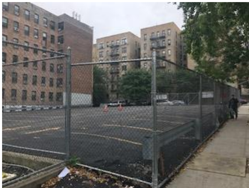
Parking Lot between 164-165 and River Avenue