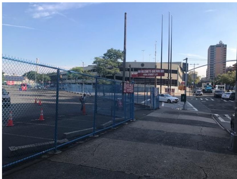
Parking Lot on 153 and River Avenue