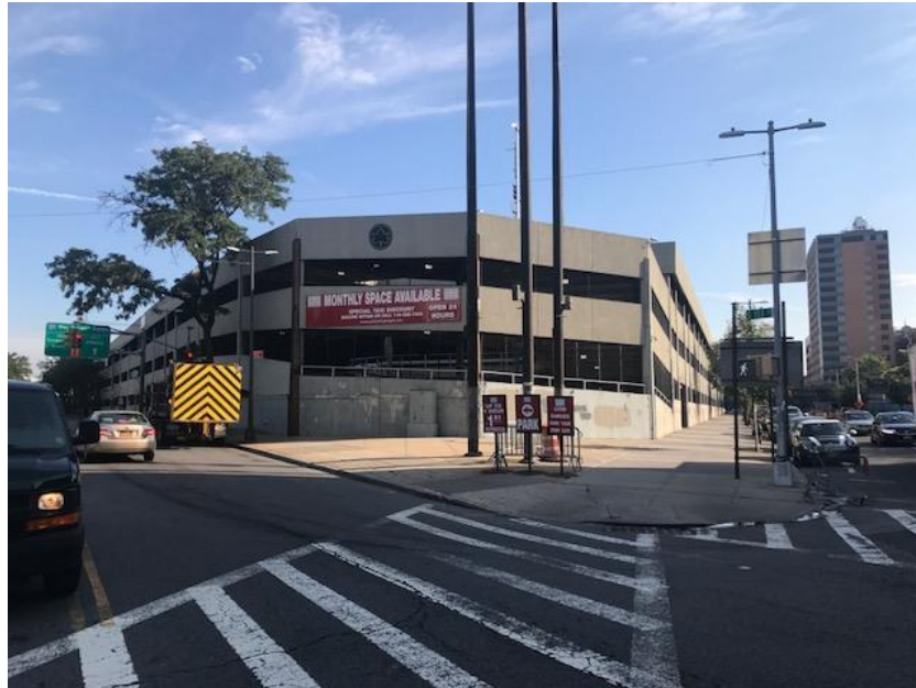
Parking Garage on 153rd Street