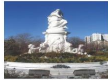
Lorelei Fountain-Joyce Kilmer Park