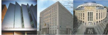
Bronx Museum of the Arts