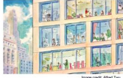
Image credit: Alfred Tau Remove arbitrary zoning rules to allow small and shared apartments in central locations, easing pressure on family-size units