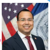
NEW YORK CITY COUNCIL MEMBER OSWALD FELIZ Proudly Representing the 15th Council District