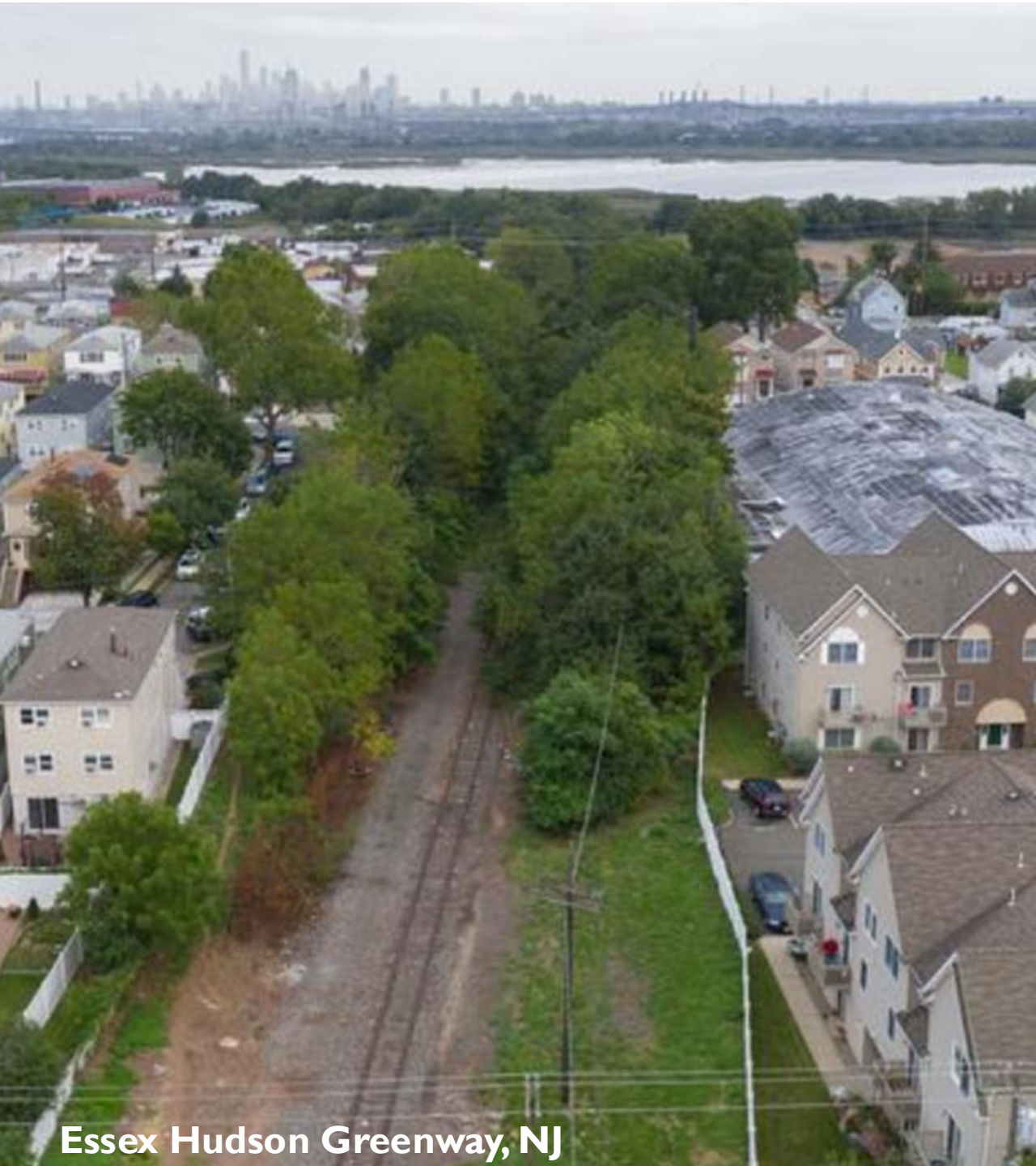
Essex Hudson Greenway, NJ