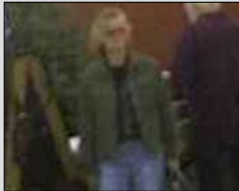
Left: Male Dealer #1 talks to Male Investigator (not pictured). Right: Female Investigator inspects a separate vendor.