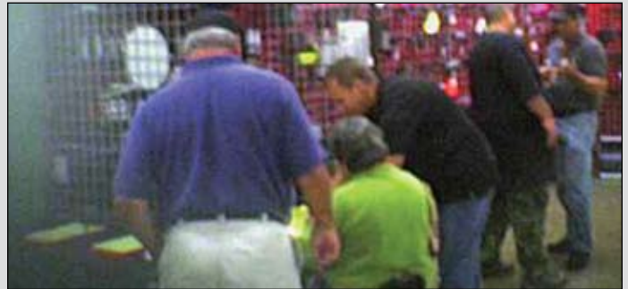
Left to Right: Male Investigator, Female Investigator, and Male Dealer.

MI: Alright. Yeah, I'm going to...My friend over here's to do some paperwork for me.