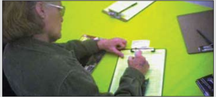
Female Investigator receives 4473 Form.