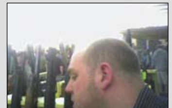
Left: Male Dealer #2 questions Male Investigator.