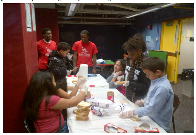
Mentors and mentees making sandwiches together for a community meal at Marolboro Houses in Brooklyn

In the Spotlight highlights an agency or provider working with the City to accomplish the goals of the Young Men's Initiative