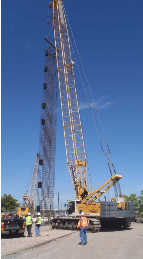
Transport of slurry wall panel across Front Street; panel is filled with concrete following placement at shaft site