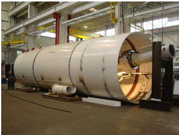
Shield (side view)