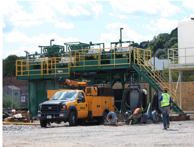
Equipment used to recycle slurry material for reuse during installation of panels