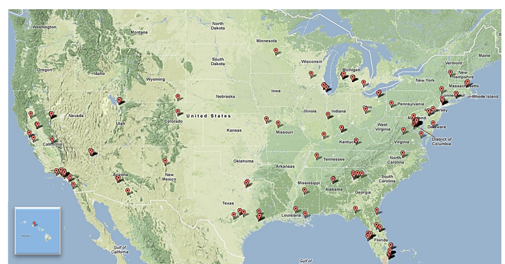
Figure 2: Registered Super PACs by Location

As shown below, the more than 250 registered Super PACs are broadly dispersed across the country – covering 34 states, plus the District of Columbia. Not surprisingly, the Washington, DC metro area is home to one-in-five Super PACs.