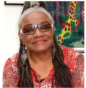
Photos, right, top down: Faith Ringgold, Clifford L. Alexander, Jr., Sonia Sanchez.